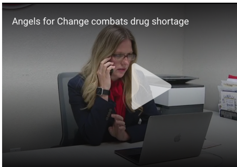
Angels for Change combats drug shortage